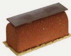
Dubai chocolate dessert