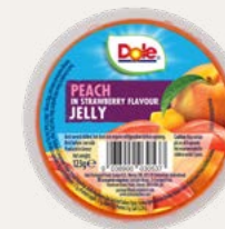
Dole Fruit in Jelly