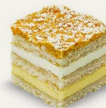
Coco mango opera cake