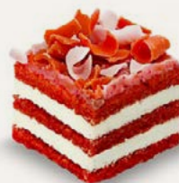
Red velvet opera cake