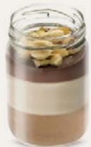
Choco rocher big pot