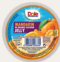
Dole Fruit in Jelly