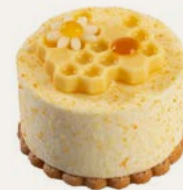
Sweet honey yoghurt