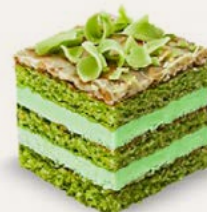
Pandan opera cake