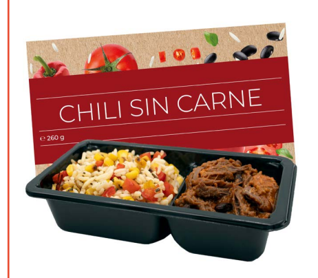
CHILI SIN CARNE 260g vegan chili with rice