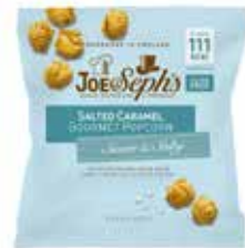
POPCORN 18 g - Salted caramel - Cheddar cheese & chili - Maple sea salt - Millionaire shortbread - Vegan toffee