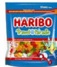
TRAVEL HARIBO PARADE 100 g - Travel parade - Gold bear and various other flavours