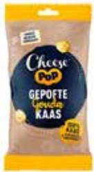
CHEESE POPS 20 g - Gouda - Cheddar - Goat - Vegan Gouda