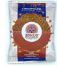
RUBY CHOCOLATE & CARAMEL WAFLE 50 g Various flavours