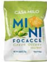
MINI PANETTI 25 g - Tomato & oregano - Lemon & ginger and various other flavors