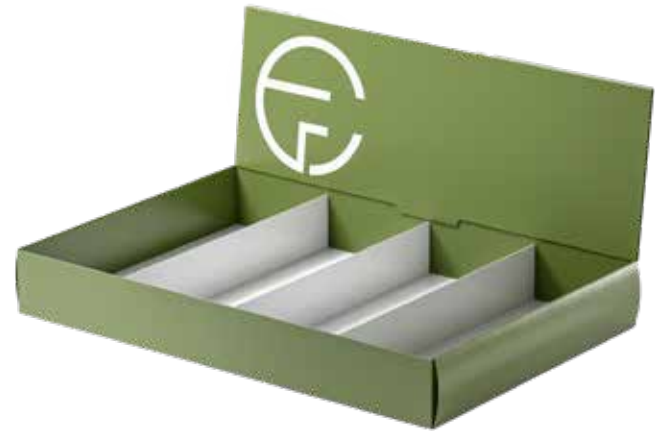
GALLEY SNACKBOX 255x385x60