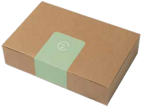
SNACKBOX LARGE 170x120x38 mm