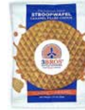
CLASSIC CARAMEL WAFLE 36 g - Honey booster