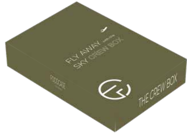
SNACKBOX CREW ONLY 372x252x105 mm