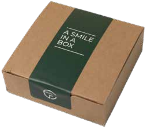
SNACKBOX MEDIUM 120x120x38 mm