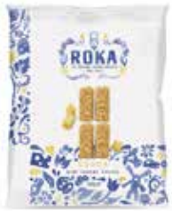
MINI GOUDA CHEESE STICKS 25 g - Cheese sticks - Cheese crispies