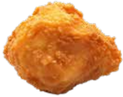
CHICKEN BITES 6 or 9 pieces Various flavours