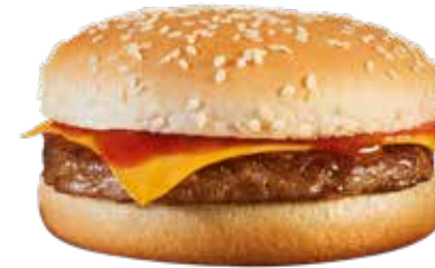
CHEESE BURGER 104 g Sesame seeded bun with a 58 g beef burger and cheese slices