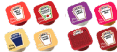
HEINZ SAUCE 25 g Various flavours - Tomato ketchup - Mayonnaise - Frites sauce - Mustard - Sweet & Sour - Garlic sauce - Barbecue - Sweet chili