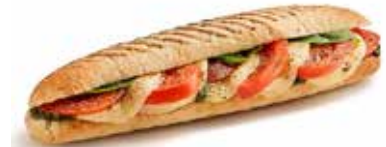
CAPRESE PANINI 110 g