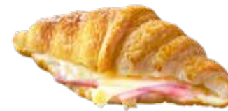
HAM AND CHEESE CROISSANT 95 g