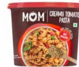
CREAMY TOMATO PASTA 74 g Fussili in a rich tomato sauce