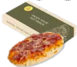
SALAMI PIZZA 130 g Oval pizza