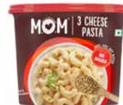
3 CHEESE PASTA 74 g Creamy macaroni with cheese