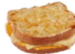
CHEESE TOASTIE 163 g With 3 cheese bechamel sauce