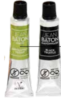
JEAN BÂTON MAYO 35 ml Vegan or truffle