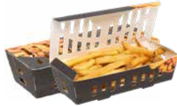
FRIES 100 g French fries