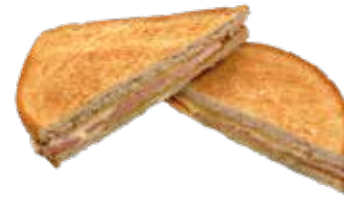
HAM AND CHEESE BLOOMER 160 g With honey mustard sauce