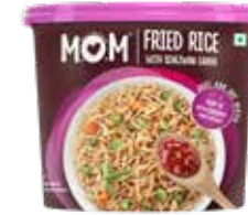
FRIED RICE 140 g Fried rice with Schezwan Gravy