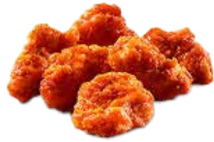
BONELESS CHICKEN 6 or 9 pieces Various flavours