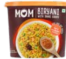
VEGETARIAN BIRYANI 140 g Biryani with Shahi Gravy