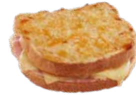
HAM AND CHEESE TOASTIE 178 g With 3 cheese bechamel sauce