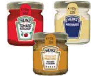
HEINZ SAUCE 35 g Various flavours - Tomato ketchup - Mayonnaise - Mustard