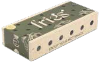
FRIES 100 g French fries