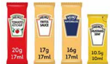
HEINZ SAUCE Various sizes Various flavours - Tomato ketchup - Frites sauce - Mayonnaise - Mustard