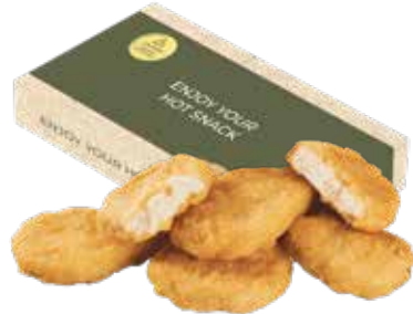
VEGAN NUGGETS 6 or 9 pieces