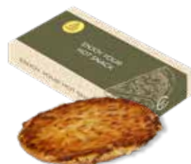
MARGHERITA PIZZA 130 g Oval pizza