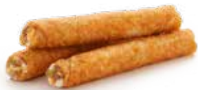
BEEF TACO ROLL 120 g - Beef - Chicken - Beans