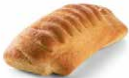
BREADSNACK Various flavours - Ham & cheese - Pepperoni - Mushroom - Spinnach feta - Curry chicken - Mexican chicken