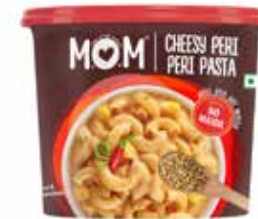
CHEESY PERI PERI PASTA 74 g Spicy macaroni with cheese