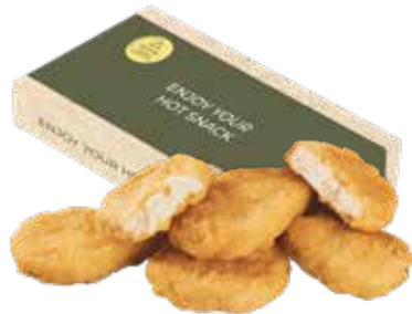
CHICKEN NUGGETS 6 or 9 pieces