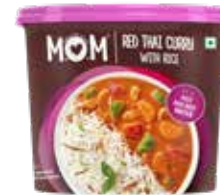
RED CURRY 140 g Red Thai curry rice