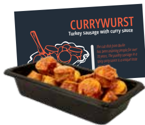
TURKEY CURRY WURST 200 g With curry sauce